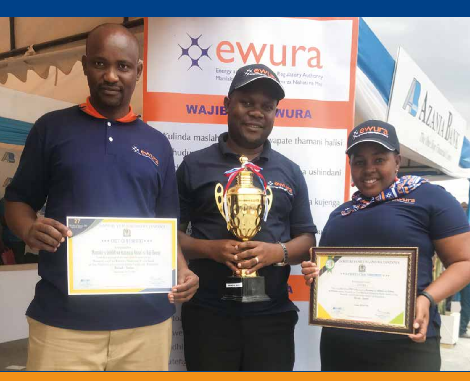
Motto: "Fair Regulation for Positive IMPACT"