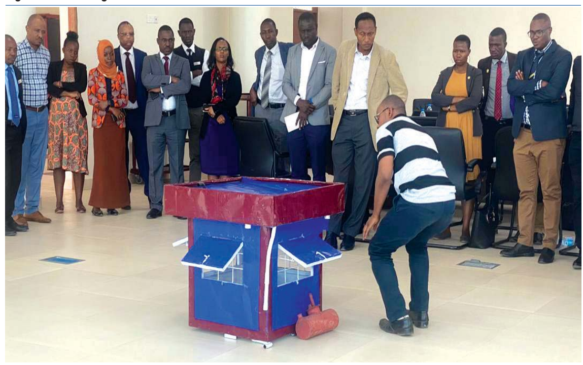
A designer displays to EWURA Management a sample of petroleum outlet suitable for rural areas recently. Construction of such facilities will simplify fuel supply to rural areas.

he Energy and Water Utilities Regulatory Authority (EWURA) has licenced 68 more rural petrol stations in 2020, making a total of 197 petrol stations in the areas by the end of 2020, increasing from 129 petrol stations registered in 2019.