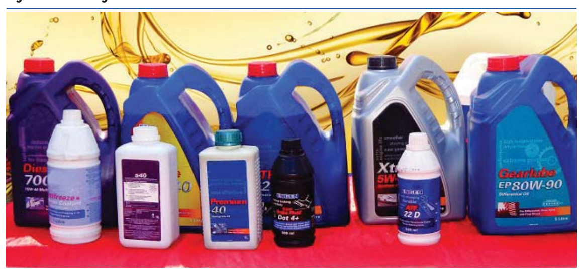
These are some of the imported lubricants of which Tanzania consumes more than 30 million litres of lubricants per year while its production stands at only about 20 million litres.

he Energy and Water Utilities Regulatory Authority (EWURA) has called for more investments in the lubricant business to meet the deficit in demand of about 10 million liters of lubricants.