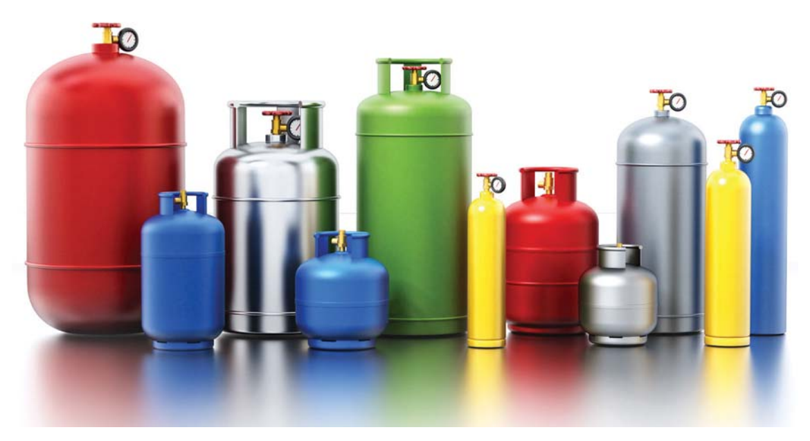
Some of LPG cylinders found to be sold bellow the approved weight by the regulator.

he Energy and Water Utilities Regulatory Authority (EWURA) has reminded domestic users of liquefied petroleum gas (LPG) to ensure that the gas they purchase is weighed and the cylinder properly sealed to ensure that they get the correct amount of gas as specified.