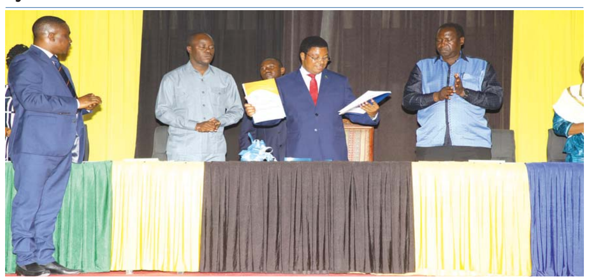
The Prime Minister Hon. Kassim Majaliwa Majaliwa (MP), displays a copy of EWURA Water Sector Performance Review Report for the 2019/20, after he launched the same at a ceremony held in Dodoma recently.

The Prime Minister Hon. Kassim Majaliwa Majaliwa (MP), has launched the EWURA Water Sector Performance Review Report for the 2019/20 financial at a ceremony held at Mipango College in Dodoma in May, this year.